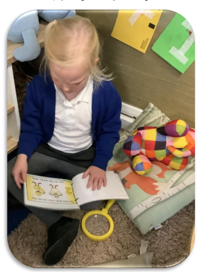
"Reading is the gateway skill that makes all other learning possible." — Barack Obama

In Reception, the children have been nurturing their love for stories and storytelling by creating exciting narratives with friends. The children had a wonderful time acting out their favourite tales using puppets in their little theatre, sparking creativity and imagination!